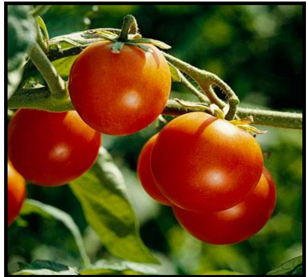
Pictures from top: Tomatoes, Rose Geranium and Garlic are currently the main contract crops.

Rose Geranium plants have been introduced at 4 irrigation projects (Mzinyathini, Duncal, Thornville and Moza). The farmers are waiting to be invited by Lynwood Ranching to witness the extraction of oil from Rose Geranium, before they will commit themselves to grow geranium on a commercial scale. The mobile still is reported to be operational and the demonstration is expected to take place soon.