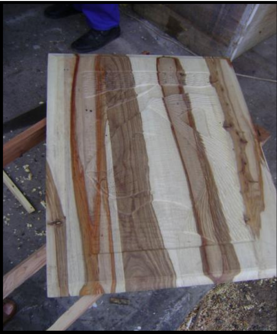
Pictures anti-clockwise from top: A small table with a carved lion head top, made by Calvezia Chuma; Sandal manufacturing by Sithabile Chipoyi; Sturdy wheelbarrows with axles made from shock absorber shafts, by Tendai Ndora.